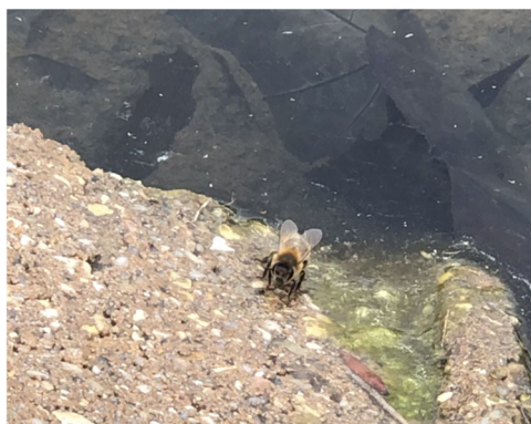
FIGURE 2 Honey bee at a turbid water source featuring algae at the ground-water interface

carotenoids (Goiris et al., 2012). The microalgal carotenoid astaxanthin is well-studied for its potent antioxidant and immunomodulating properties (Higuera-Ciapara, Felix-Valenzuela, & Goycoolea, 2006). Currently, the main source of microalgal astaxanthin is Haematococcus pluvialis , but additional species are under investigation for the production of astaxanthin and related carotenoids (Ambati, Phang, Ravi, & Aswathanarayana, 2014).