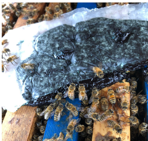
FIGURE 3 Delivery of a pollen substitute patty containing Arthrospira (spirulina) biomass to a honey bee colony